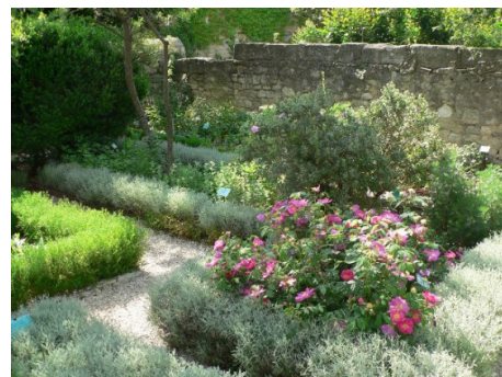
Parks and Gardens