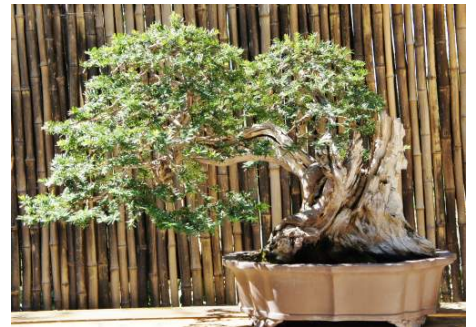
Parks and Gardens