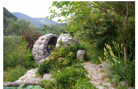
Parks and Gardens